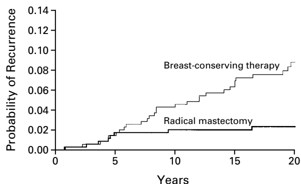
Figure 1. Crude Cumulative Incidence of Local Recurrences after Radical Mastectomy and Recurrences in the Same Breast after Breast-Conserving Therapy.

at base line. In the radical-mastectomy group, the overall rate of local recurrences was low (average, 0.17 per 100 woman-years of observation) and was not significantly affected by the patient's age and the size of the tumor at base line. The rate of recurrences was relatively high among women with more than three axillary nodes containing metastases, but the importance of this finding is uncertain because of the small number of such patients. In the group that received breast-conserving therapy, the average event rate was almost four times as high (0.63 per 100 woman-years of observation) as the rate in the radical-mastectomy group. The rate in this group varied with age and was high-